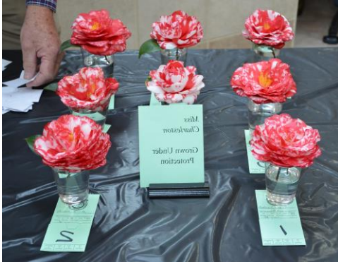
Photos from the National Show in Charleston. Both are of Miss Charleston , with the photo on the right showing the winner.