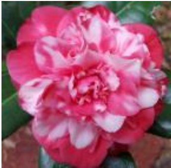
Paul Haskee Variegated