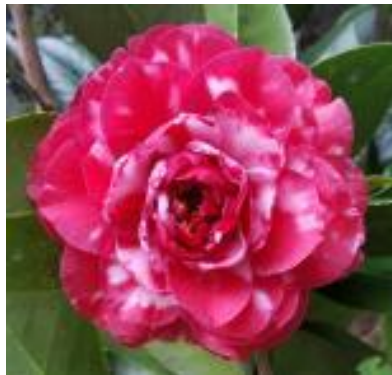
Nuccio’s Bella Rosa Variegated

Search “Gainesville Camellia Society” to find our Facebook page. There you will find photos, tips on growing camellias, special activities, announcements of future meetings and guest speakers. “LIKE” us on Facebook to receive GSC updates, and tell your friends about the Gainesville Camellia Society Facebook page.