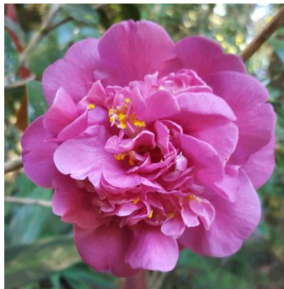
Blue Danube, a hybrid

Wow, our bloomers are showing!! Maybe I should rephrase that? Many, many camellias are now in bloom, many of which seem to be blooming a bit earlier than usual. As cooler weather finally arrives, it should slow things down at least a bit. Lots of the "Early" listed bloomers are indeed in full bloom, or already past it. Anyway, there is much to enjoy in the garden this time of year. Sharing of blooms with friends and neighbors is a much appreciated gesture and spreads the enjoyment around.