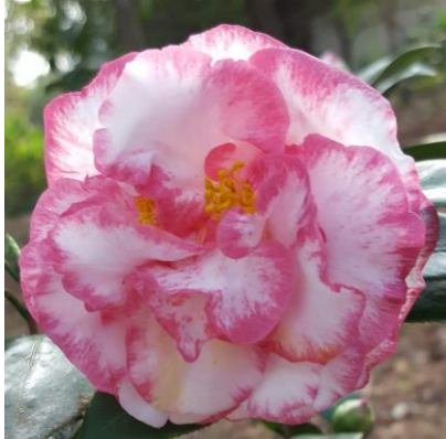
Betty Sheffield Supreme

Continue your planting program. This is still a great time to get camellias from pots into the ground. If you are gibbing, continue to do so, and now is the time to plan for showing blooms at the GCS Show in January, as well as other shows later in January and February in Florida and South Georgia. Cards required to show blooms were briefly explained during the October meeting and will be available at the December Holiday Party meeting. In case you missed the intro on how to fill out the cards, seasoned GCS members will be glad to show you how to do it.