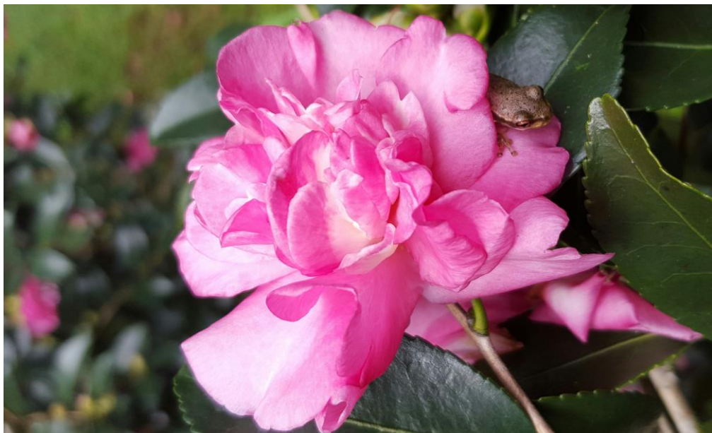
A beautiful example of the cultivar "Sparkling Burgundy"