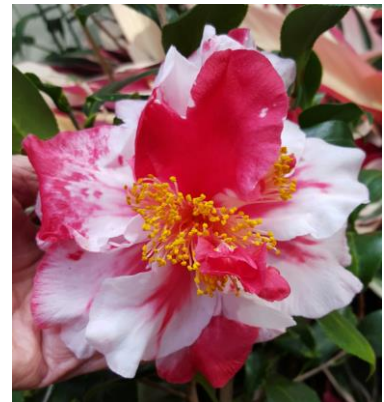
Edna Bass Variegated